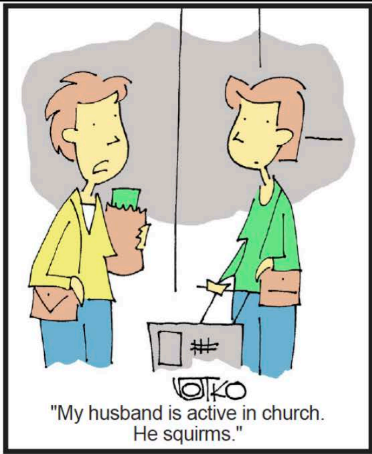
"My husband is active in church. He squirms."